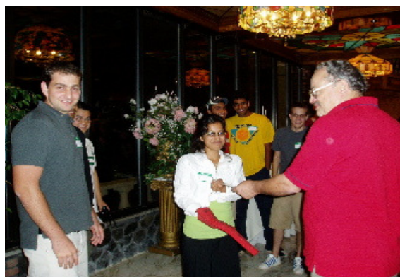
2006 College Bowl: In order left to right: NJIT, Rutgers, Princeton and Seton Hall