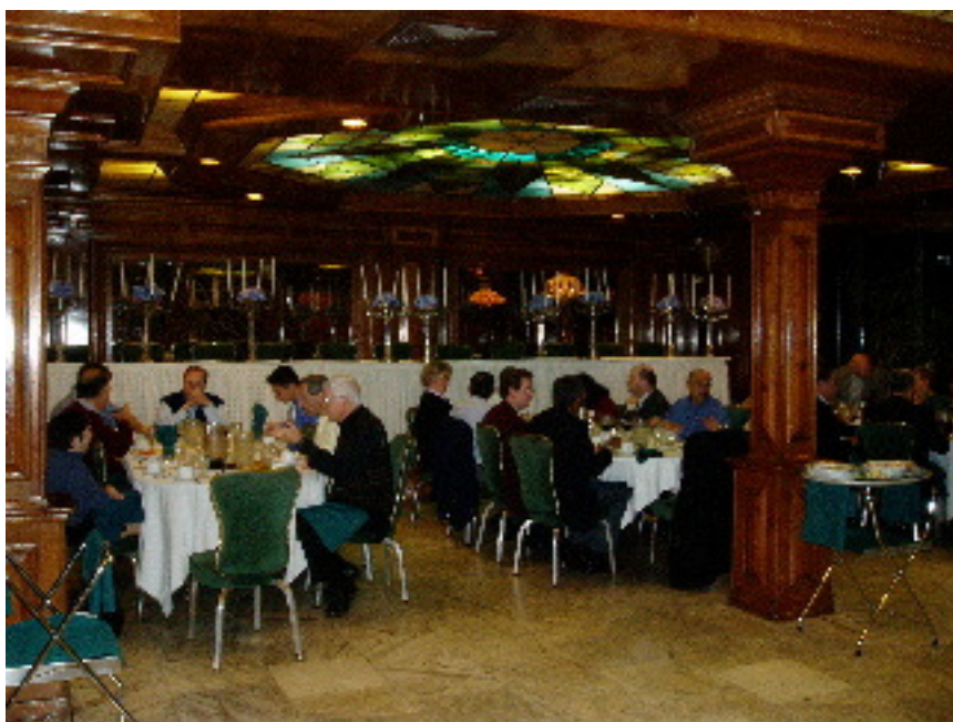
XMAS PARTY SHOTS

Contact the section secretary for details and questions.